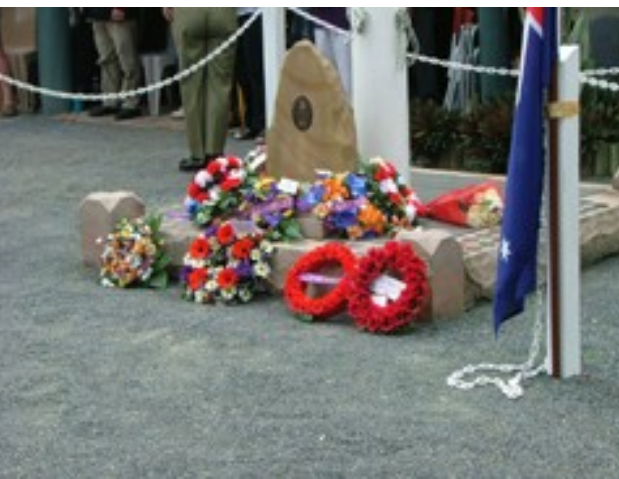
Remembering Veterans from Rockhampton, Yeppoon and Emupark areas by placing a engraved plaque in their name on the memorial