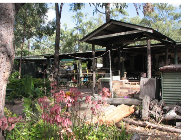
The benefits of the site became apparent to all involved

Cockscomb Veterans Bush Camp grew as a result of our local Central Queensland Veterans needing a place that they could go for some peace and quiet, somewhere they could go and feel at ease, be it with other Veterans and not be concerned about their environment. In 1997 a local Rockhampton Psycologist suggested they visit his property at Cawarral, 30 kilometers from Rockhampton.